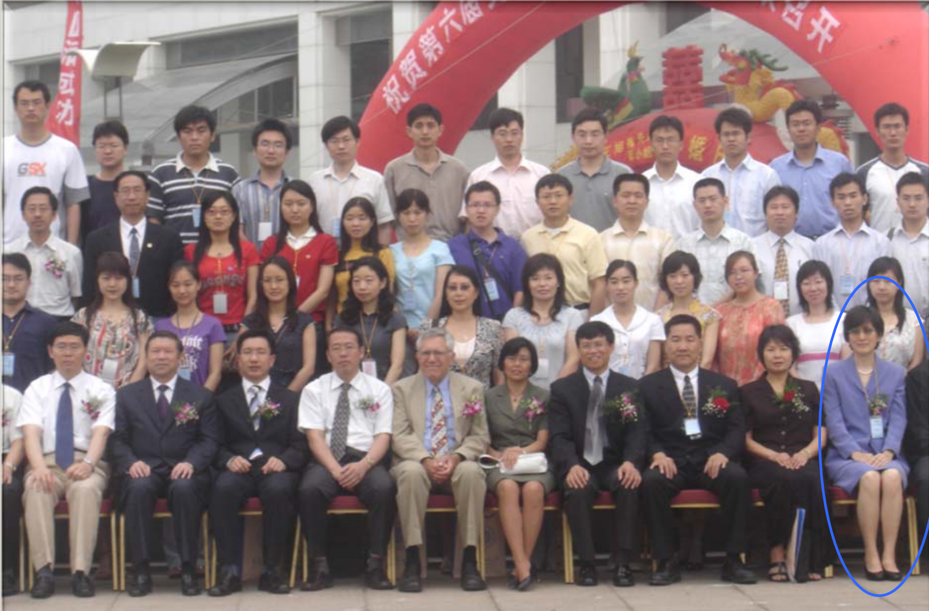
The Sixth NACOTA Conference in Shanghai, China, 2006