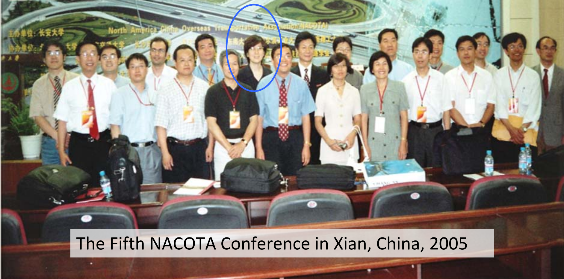
The Fifth NACOTA Conference in Xian, China, 2005

The 5 th International Conference of Transportation Professionals