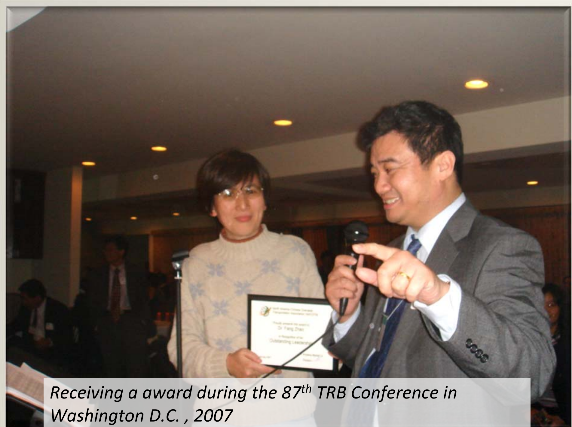
Receiving a award during the 87 th TRB Conference in Washington D.C. , 2007