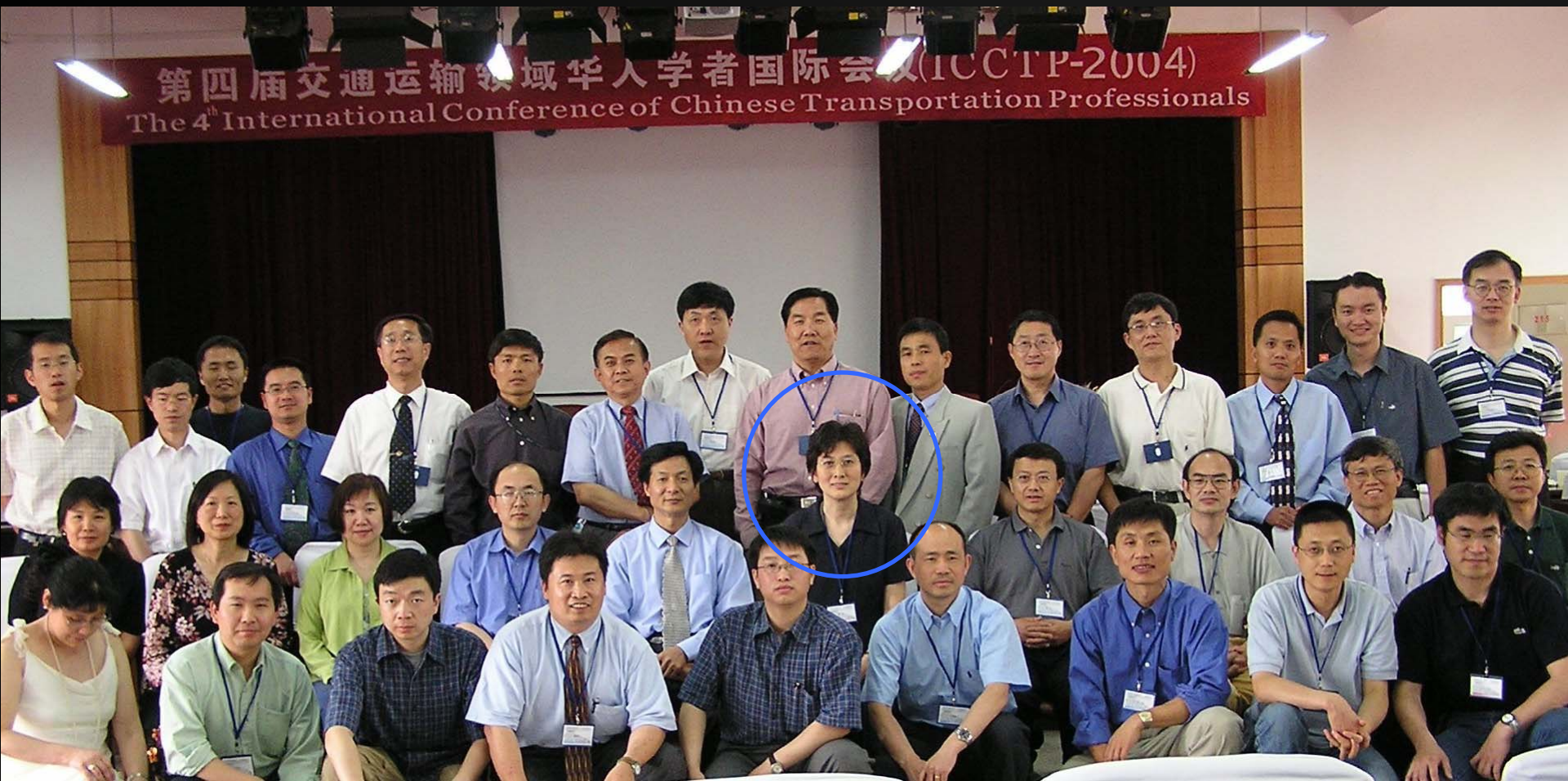
The Fourth NACOTA Conference in Wuhan, China, 2004