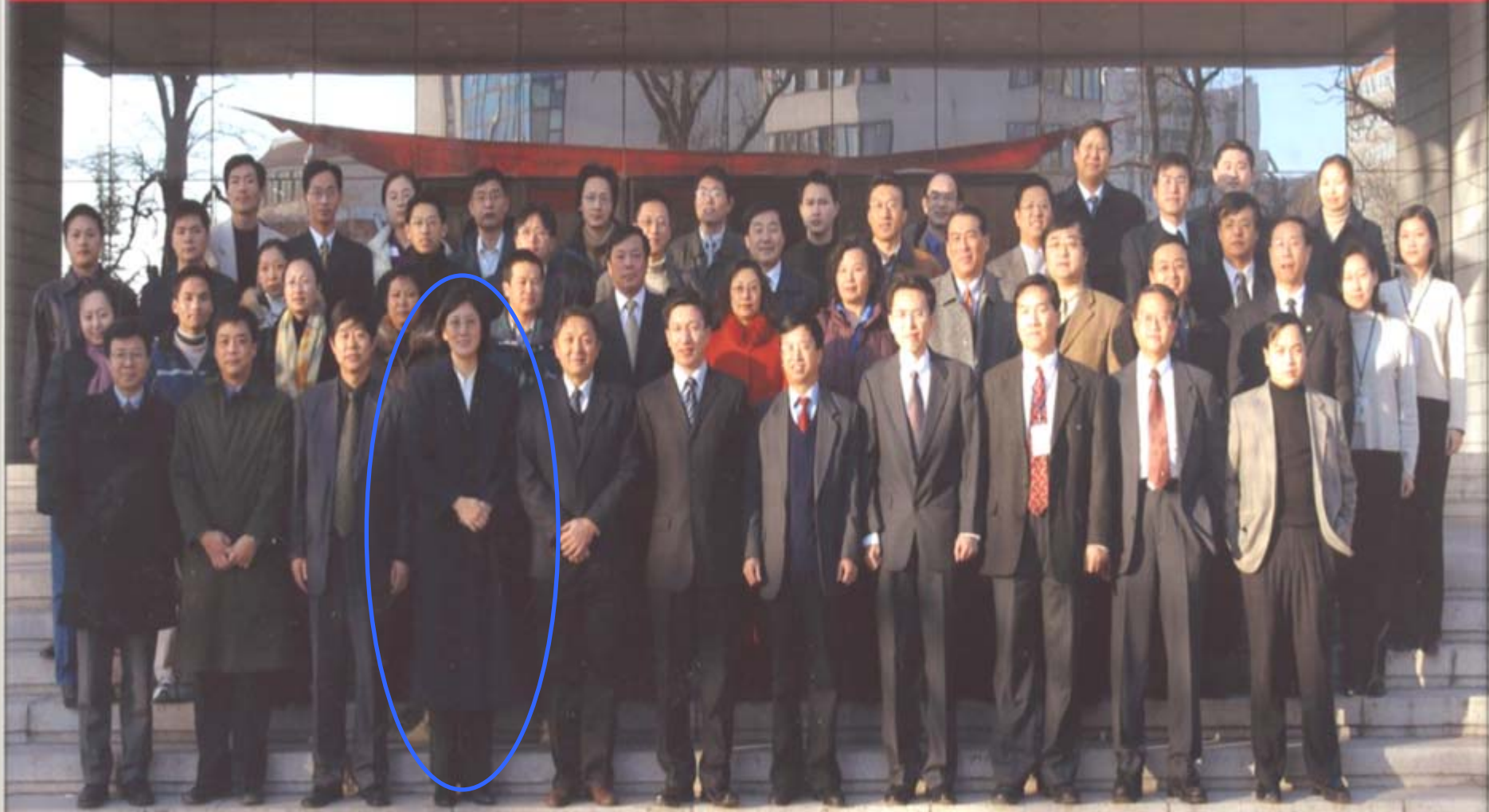
The Third NACOTA Conference in Beijing, China, 2003