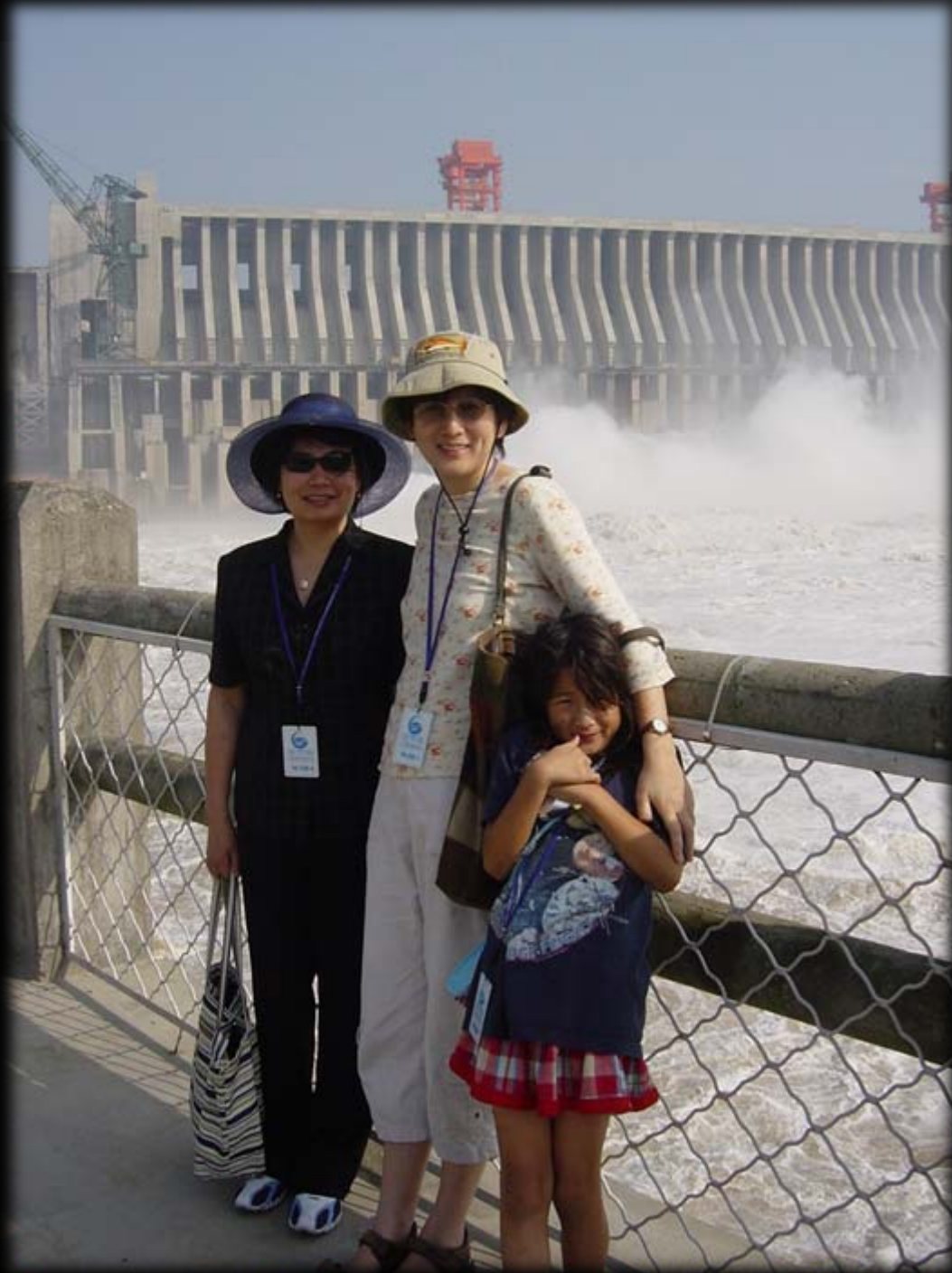
Visiting the three Gorges Dam