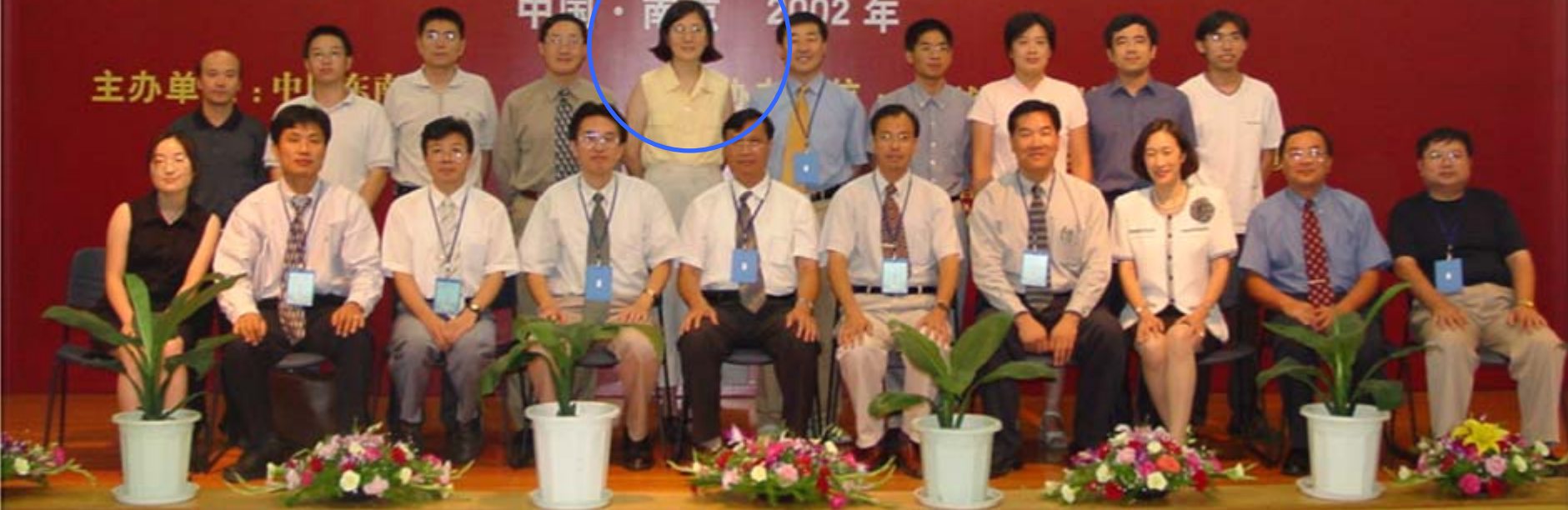
The Second NACOTA Conference in Nanjing, China, 2002