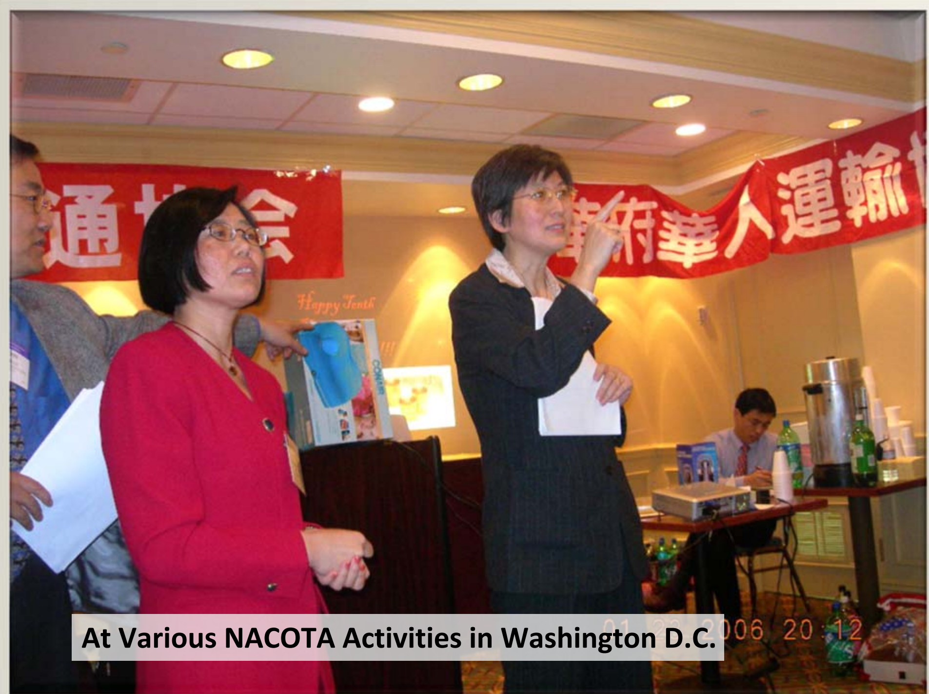
At Various NACOTA Activities in Washington D.C.